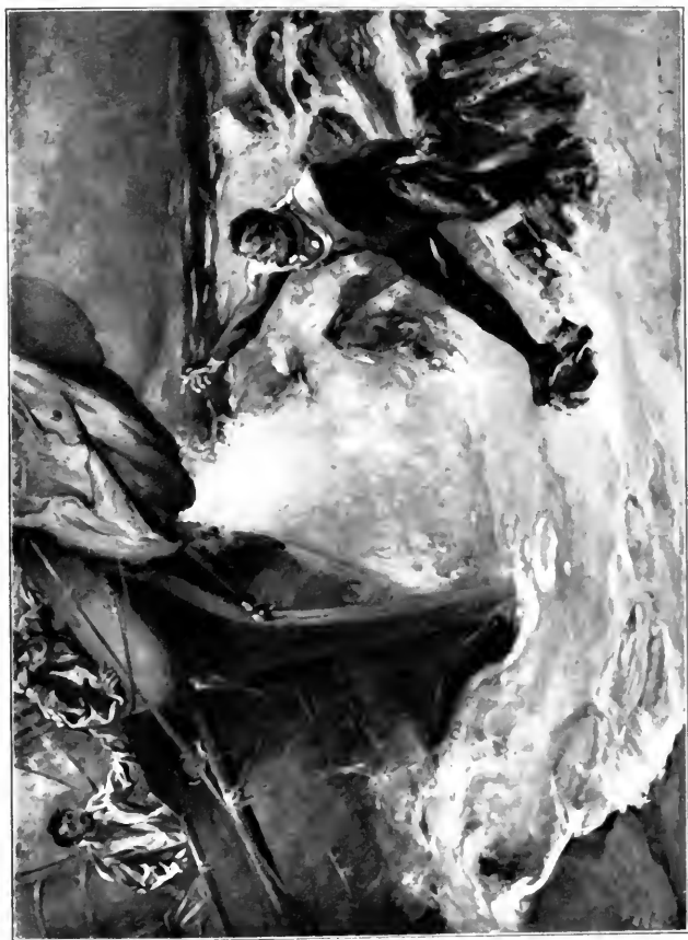
The slightest misstep on the slimy rocks meant sending him under the sloop's bow.